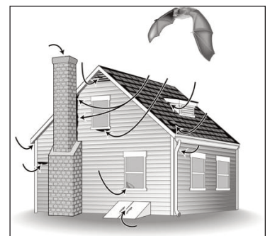
Potential bat entry points.

Some skill is required to identify all potential entry points and to apply exclusion materials to openings. Openings through which bats are entering and exiting a structure may be identified from inside the structure by entering the roosting area, an attic for example, on a sunny day when light can be seen through the openings. Another method is to turn on a bright light in the attic at night and look for light escaping through the openings on the building's exterior. Dark stains may be seen around and beneath openings used by bats.