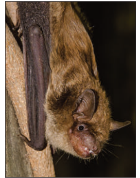
Big Brown Bat

All Illinois bats are protected under the Wildlife Code (520 ILCS 5/1.1). Bats may not be shot, trapped, transported, or held in confinement except when a bat is found in an area where they may have contact with humans or domestic pets.